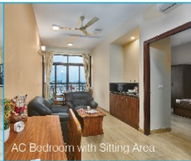
AC Bedroom with Sitting Area