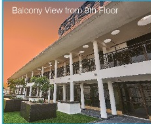
Balcony View from 9th Floor