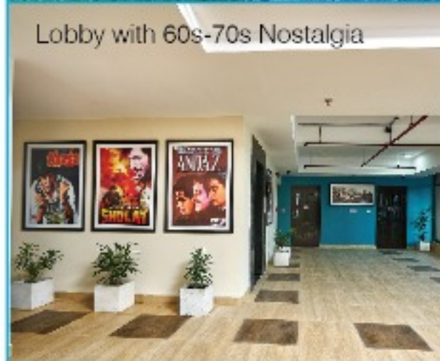
Lobby with 60s-70s Nostalgia