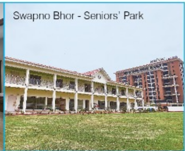
Swapno Bhor - Seniors' Park