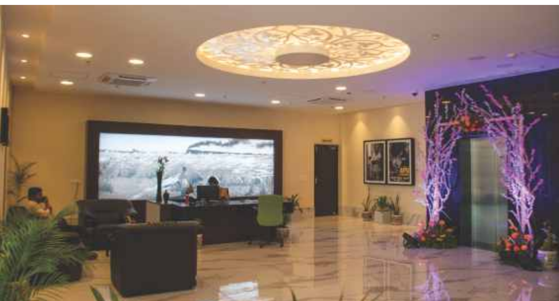
Reception with motifs inspired from Alpana and stills from Satyajit Ray movies creating an aura of the past.

The grand ambience of each floor is taken a notch higher in the 9-10 floors. The colonnade, an intrinsic part of traditional architecture, has been reimagined and elevated from the ground floor with a lawn- making it the perfect spot to sit in the shade with a cup of tea, soaking in the panoramic views.