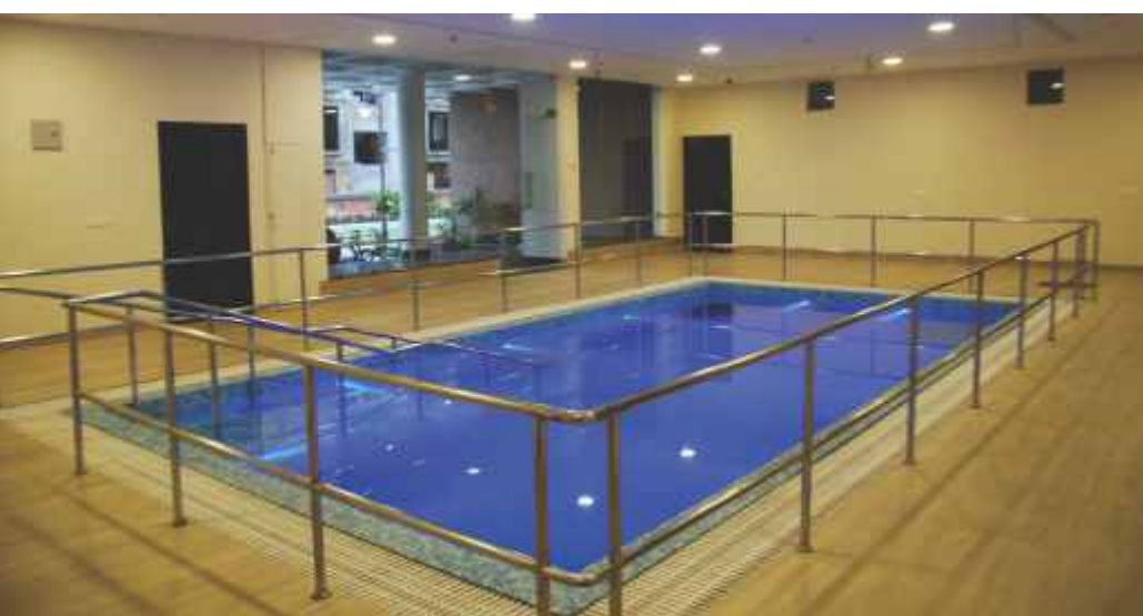
Hydrotherapy pool, where one can immerse oneself in the water and use its natural healing effects.

The age-old, effective technique of using double layered brick walls have been integrated on all external surfaces to insulate the rooms and keep them cool, further reducing the energy consumption of the highly efficient VRF systems.