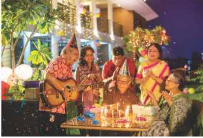
Birthday party of senior residents in the Sky Garden at 9th Floor